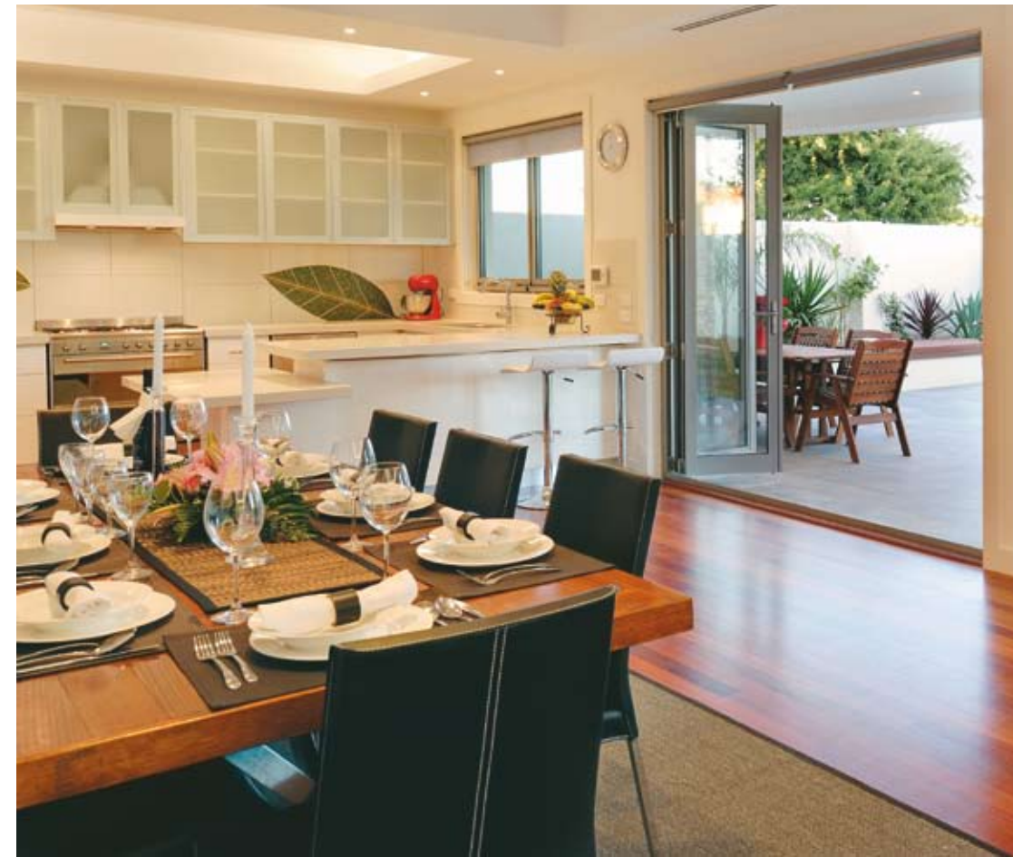
Above Enjoy the freedom of indoor and outdoor rooms becoming one by incorporating bi-fold doors. Left Dark furnishings in the bedroom complement the vibrant floorboards with style.

There is a large living area of approximately