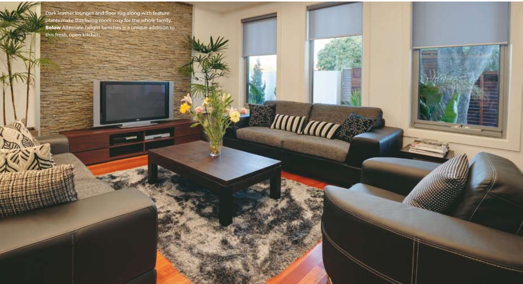
Dark leather lounges and floor rug along with feature plants make this living room cosy for the whole family. Below Alternate height benches is a unique addition to this fresh, open kitchen.

and glass mosaic tiles is a unique step forward in this luxury kitchen design.