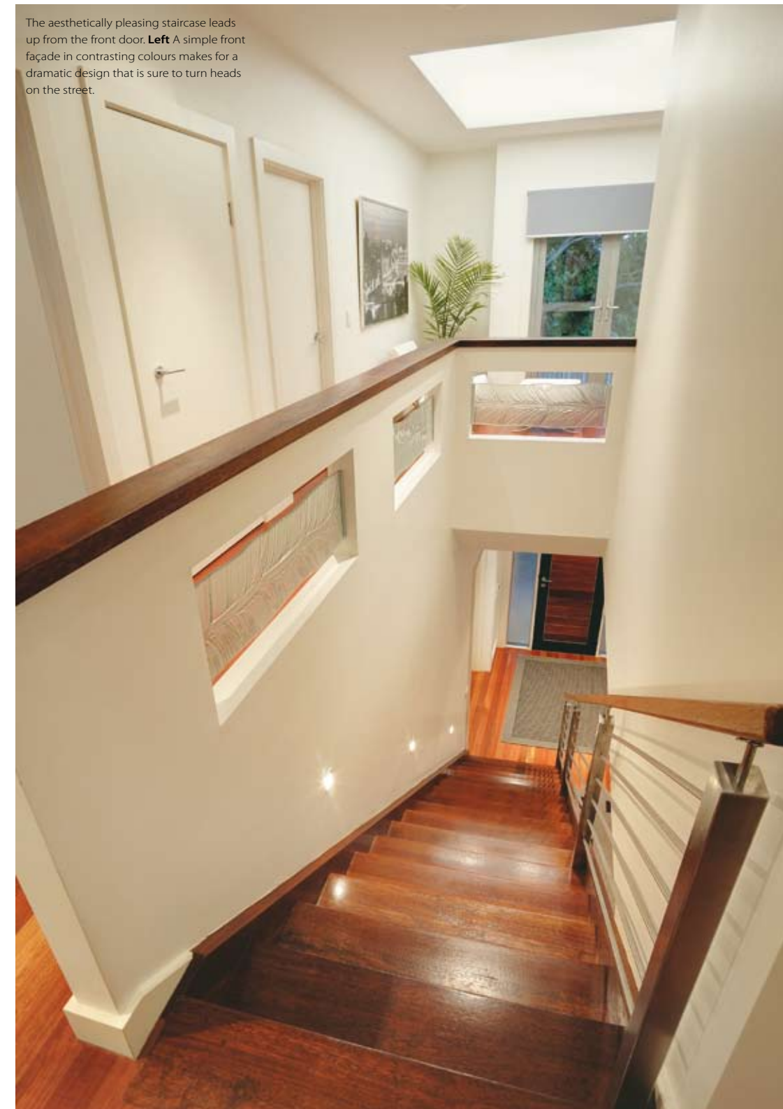
The aesthetically pleasing staircase leads up from the front door. Left A simple front façade in contrasting colours makes for a dramatic design that is sure to turn heads on the street.